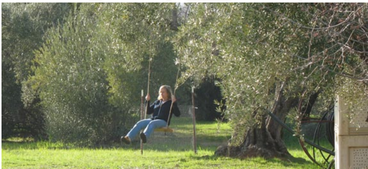
It's not all work...

To Soften Skin: Mix together equal parts of extra virgin olive oil and salt (we love sea salt). Gently massage into the skin then wash off any excess.