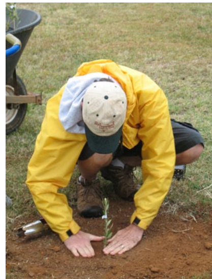
Planting a Picual

http://www.sylverleaf.com/harvestRecords.html