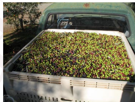
Carry on, Pile. Carry on...

On December 1st, 2007, we saw the most enthusiastic and motivated picking crew that has ever been in our orchard. It almost looked like people were having fun! Thanks to our all-volunteer crew for their hard work! We harvested 1451 pounds of olives , making about 28 gallons of amazing olive oil. (It was our best selling Verde EVER.) Don't think that harvest 101 was ALL about work. In honor of the 102-year old olive trees, we served Mexican hot chocolate, coffee and Sangria along with tacos and posole. Check out all of these recipes on our web site: