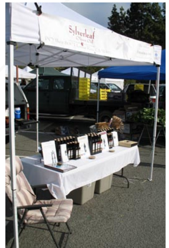
At the Market